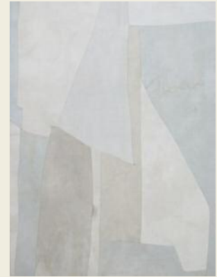
Untitled, 2016. Colleen Heslin